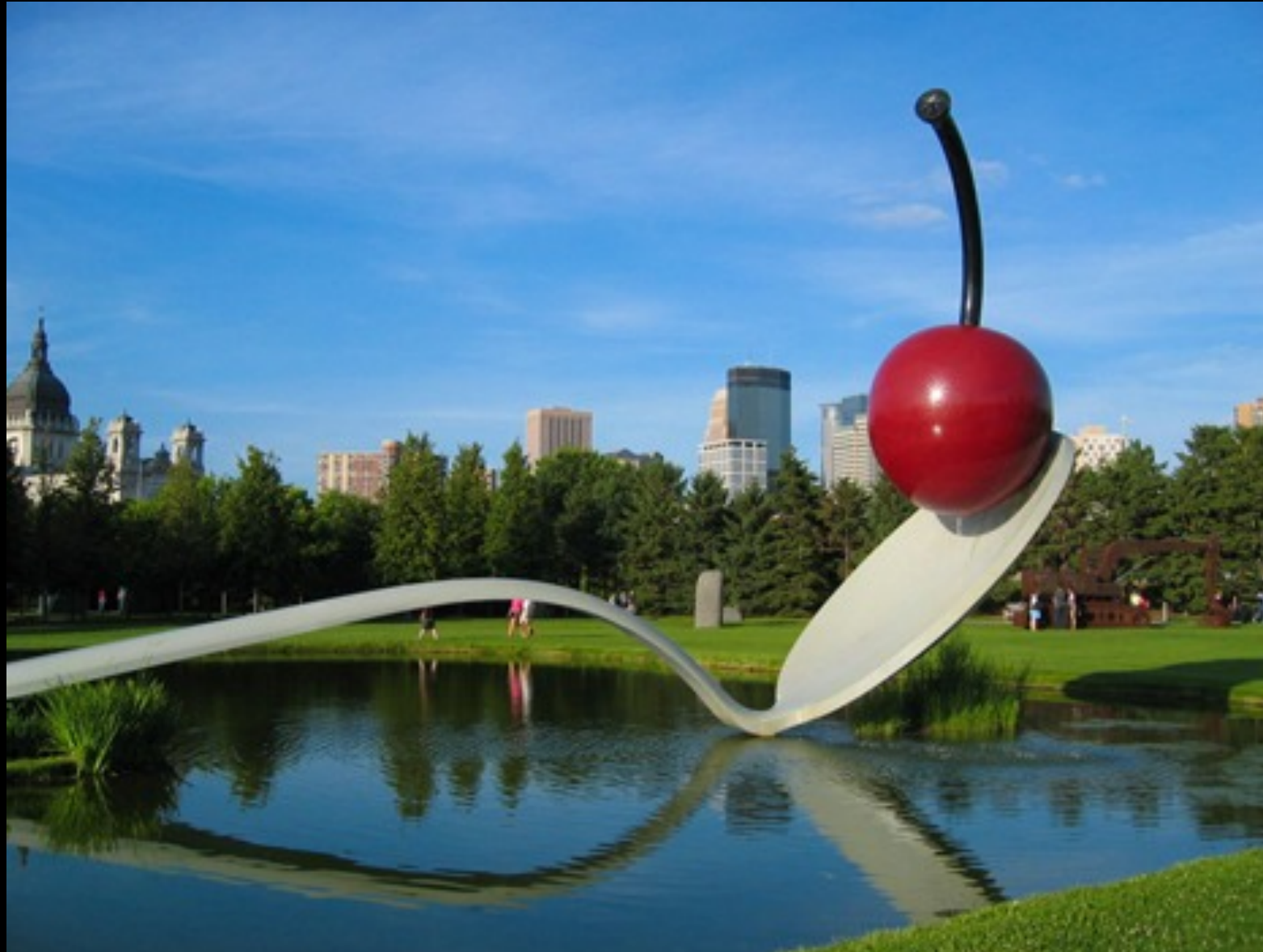
Claes Oldenburg, Spoonbridge and Cherry , Minneapolis, Minnesota, 1985